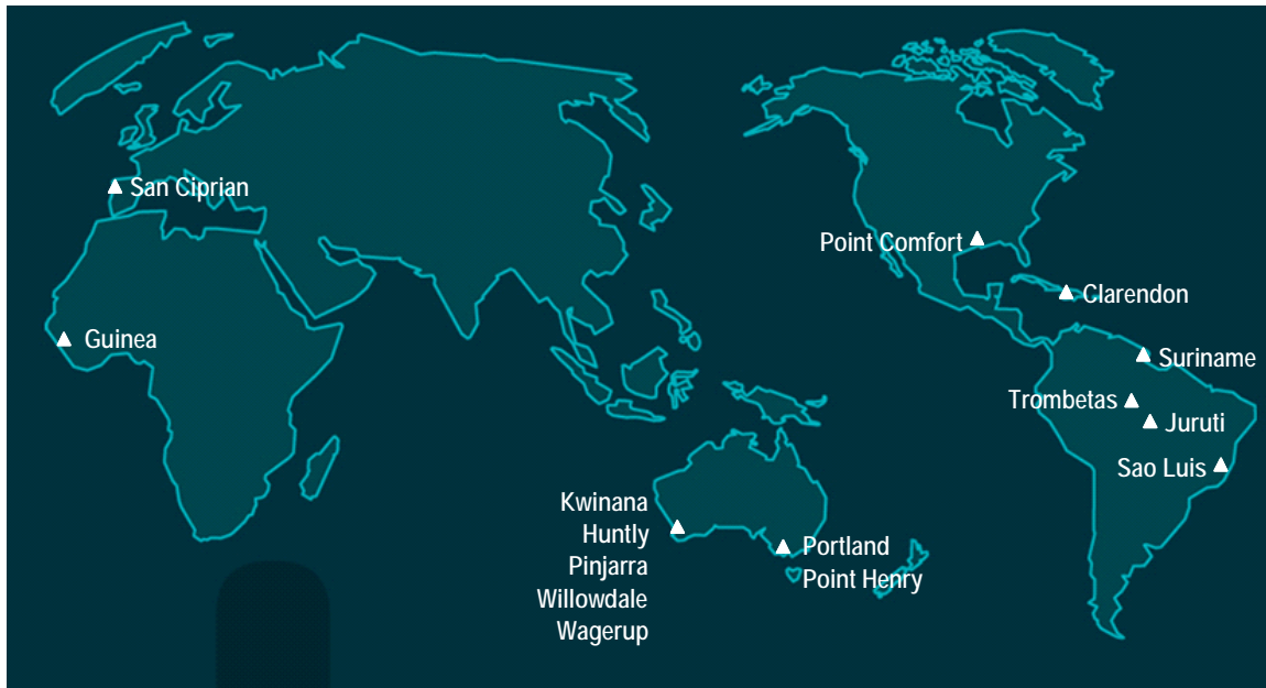
Diagram of AWAC Operations