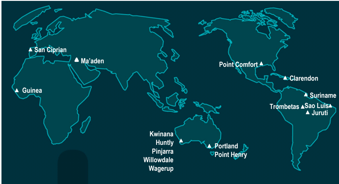
Diagram of AWAC Operations